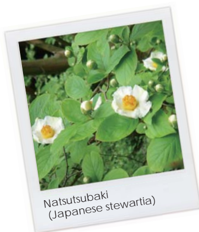
Natsutsubaki (Japanese stewartia)

This architectural blend of an entirely Japanese-style main building with detailing that incorporates Chinese elements is the oldest existing architecture of its kind. This hall was designated as a national treasure in 1964 and has been opened to the public every 33 years.