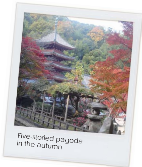
Five-story pagoda in the autumn

A long, long time ago at this site, known as Kusado Town, there used to be an old temple called Jofuku-ji, the temple that preceded Myooin. The temple is believed to have been founded by the High Priest Kobo Daishi in 807 A.D., and it is said to have had a long history of over 1,200 years.