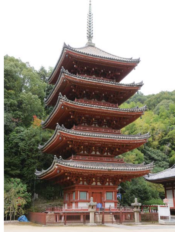
National treasure five-story pagoda

You can see a pagoda finial on the top of its roof. Characters impressed on its base tell that the pagoda was built on December 18th, 1348. This building was designated as a national treasure in 1953 and has been opened to the public every 33 years.